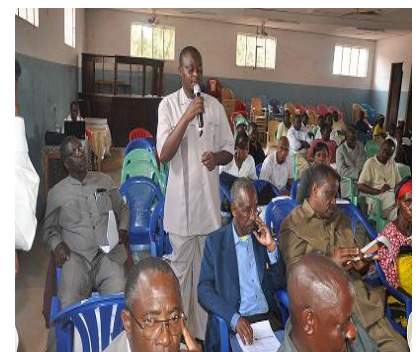
A participant posing a question

One of the participants has a concern that there was a team that made baseline survey and some of the community were pointed that are victims and are already thinking of relocation, today there is a different story which led to reduction of impacts as well as affected areas , he recommended that it is very important to make the community aware of any changes as up to the moment some community members are not certain of their status. It was then agreed that community engagement is very important.