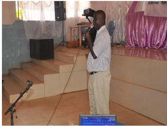
DCDO in his presentation

In his presentation District community development officer, stated with a word of thanks to NELSAP and NBI for they have been able to engage communities in the project in question.