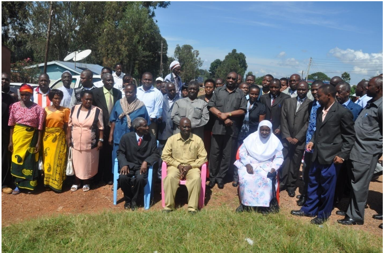
Participants posing for a group photo during 3 rd April TNDF forum in Ngara, Kagera Tanzania

Having analyzed from the discussions and the group work presentation, it is obvious that more deliberate efforts are still needed to raise community awareness on the project in question. This should be done alongside strengthened communication systems in the project area within all stakeholders.